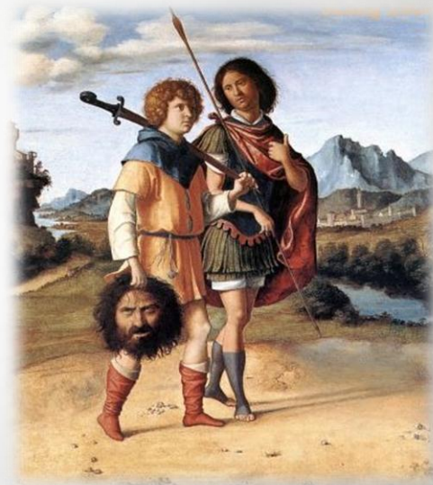
David and Jonathan Greatest Loyalty