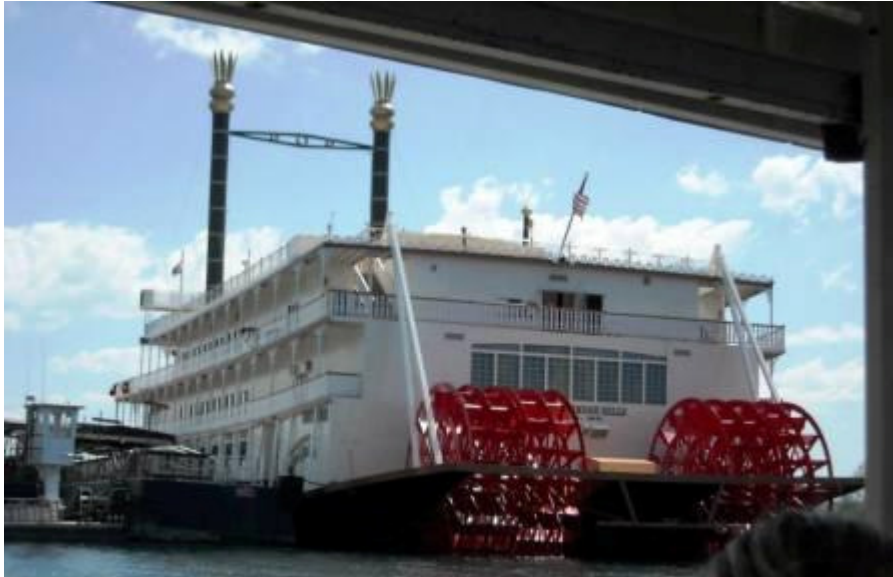
The group gathered in the steamboat and enjoyed the banquet