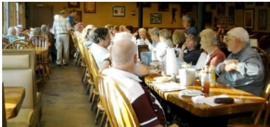
A banquet in the steamboat