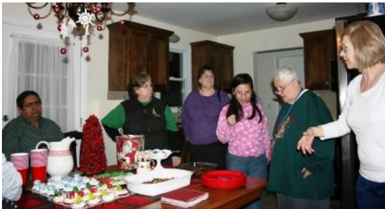
Choices of desserts to decide