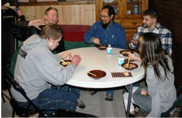
The group enjoyed their bowls of soup and fellowship in Changs' home