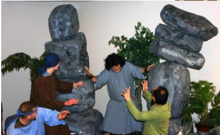
Samson was given one last chance to do right for God