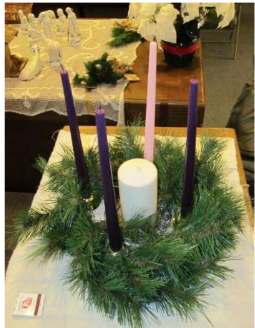
Celebration of Advent with wreath and candles

Jerry Sanders lit the candles and explained the purpose of the Advent since Sunday after Thanksgiving until the last Sunday before Christmas Day