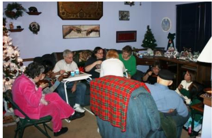
Attendants sat around enjoying bowls of soup while looking at the theme of bears and feeling the spirit of Christmas