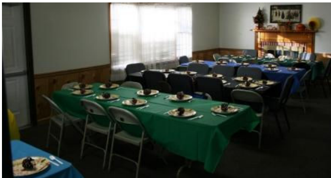
Empty tables were ready to be filled

People were waiting for yummys to fill their stomachs