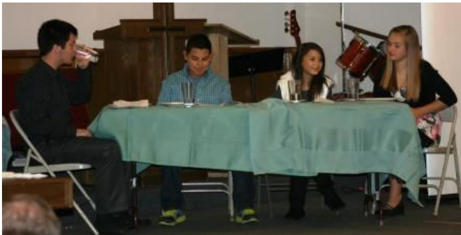
The teens performed at the play concerning being thankful, not grumpy