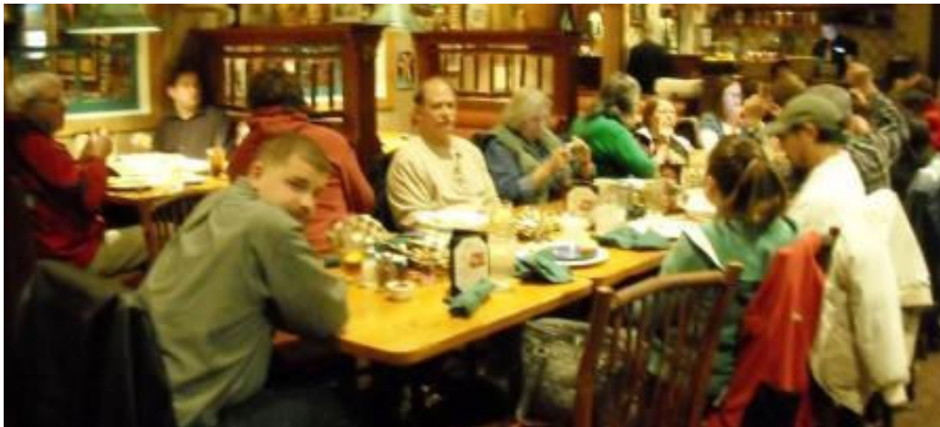
All who served Jesus Christ in the church gathered together and enjoyed the meals before devotional