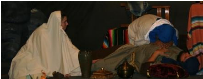
Mary and young Jesus mourned over the death of