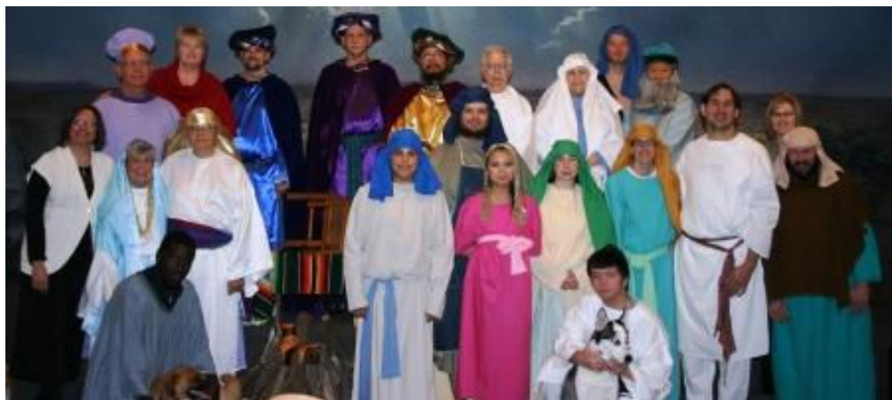
The cast and crew for the play "Joseph"