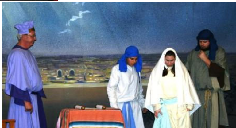
Joseph and Mary sought for Jesus and found him in the temple