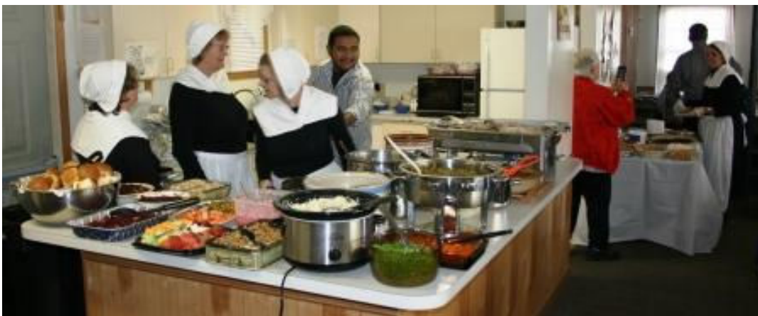
The Puritan women served Thanksgiving dinner