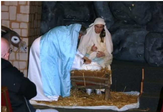
Baby Jesus laid on the hay in a manger with a help from the owner of the cave who helped with the birth