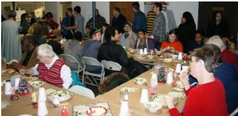
Those who sat enjoyed their meal while those in line waited for delicious Christmas meal