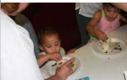
The youngsters made faces on their puddings