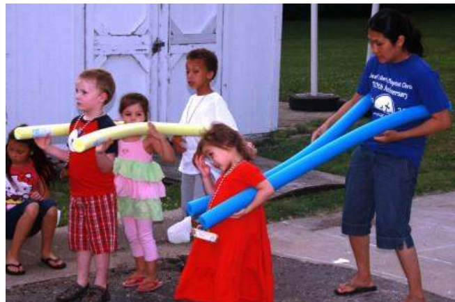
The younger kids played taxi race