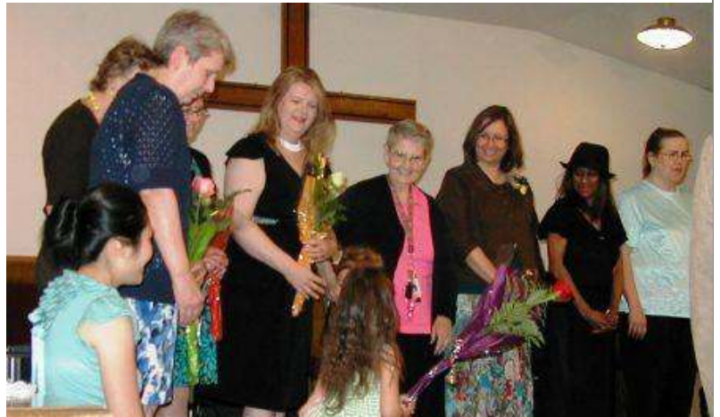
Young girls handed out roses to every mother on the stage