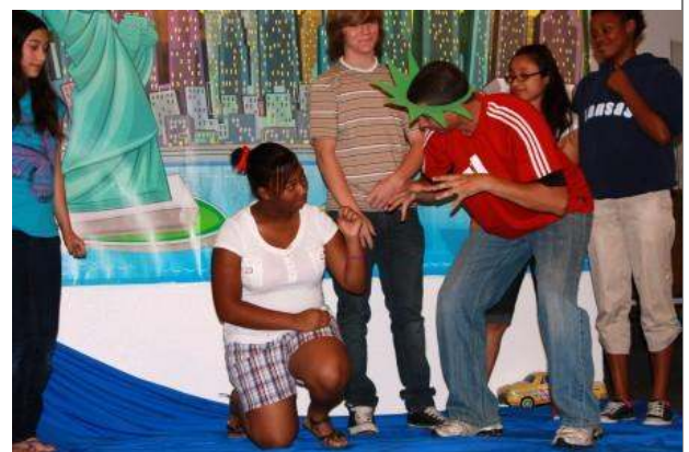
Teenagers performed a skit before the congregation on Family Night