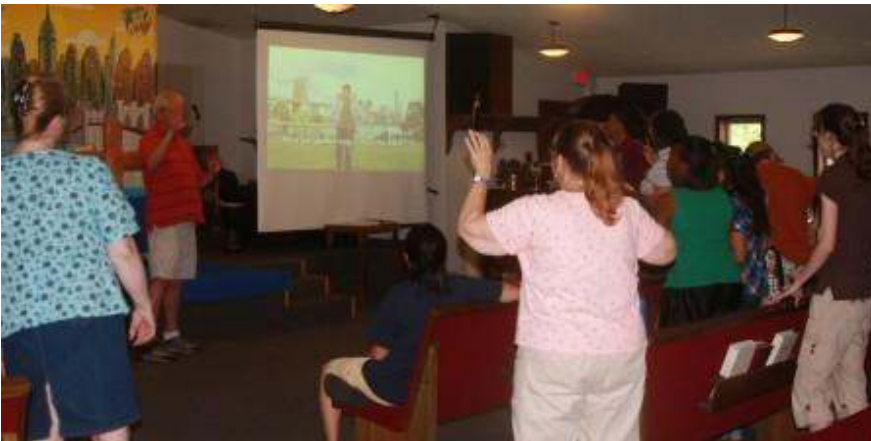
Many stood and sang the worship