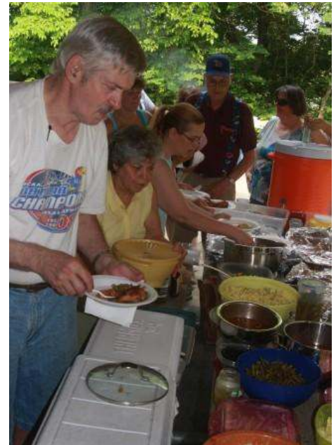
Lining up for yummys including BBQ chickens