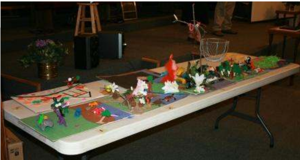
Display of God's creation by Children's class