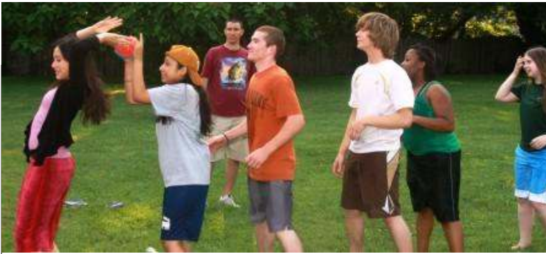
They were passing before the balloon bursted.