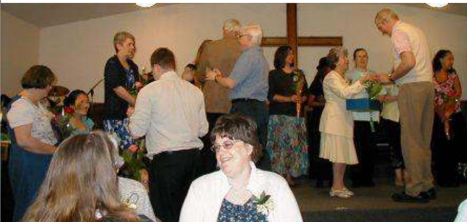
Every mother received a corsage as put on by husbands and friends