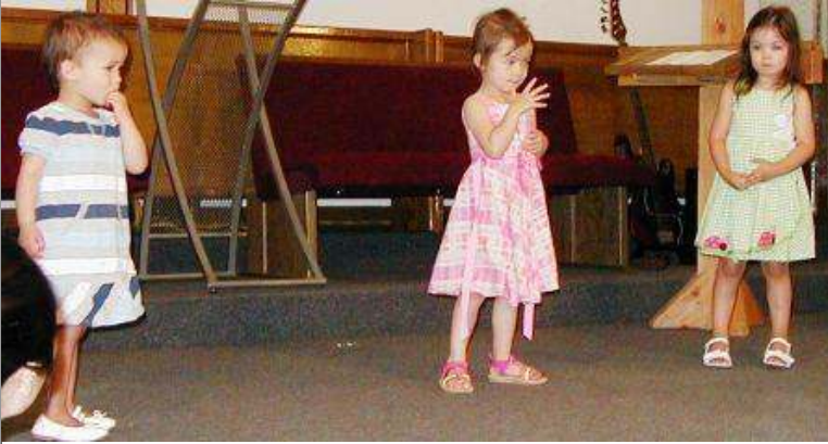
Three young girls sang Happy Mother's Day to all the mothers in the audience