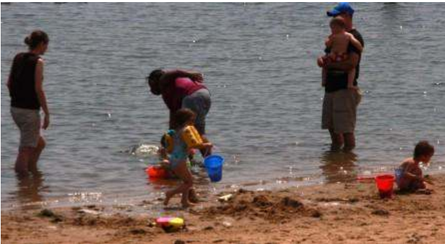
Having fun at the beach in Kill Creek Park